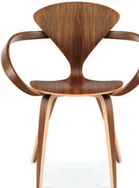
Classic Seat Pad only