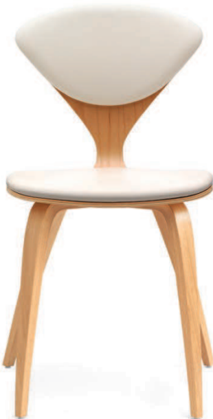
Classic Seat and Back Pads