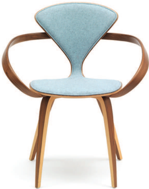
NEW one piece upholstery