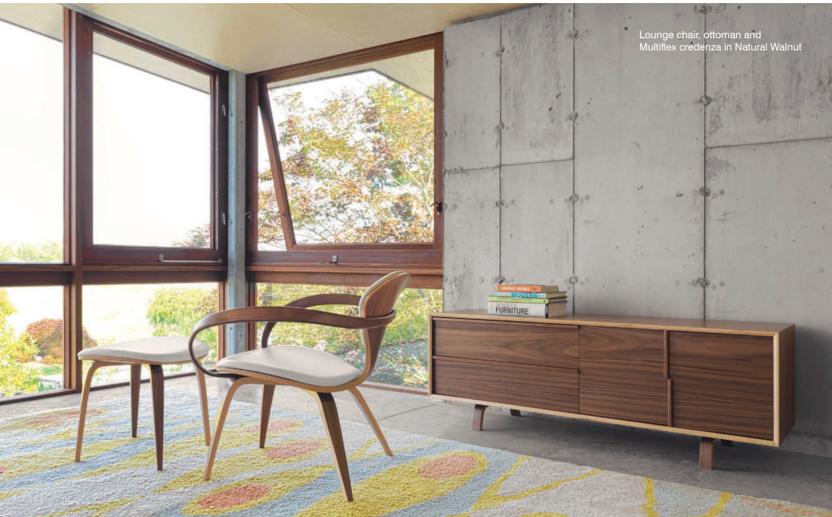
Lounge chair, ottoman and Multiflex credenza in Natural Walnut