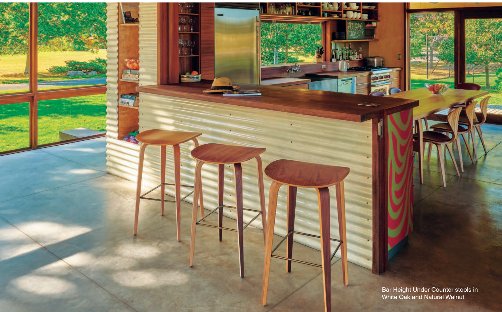
Bar Height Under Counter stools in White Oak and Natural Walnut