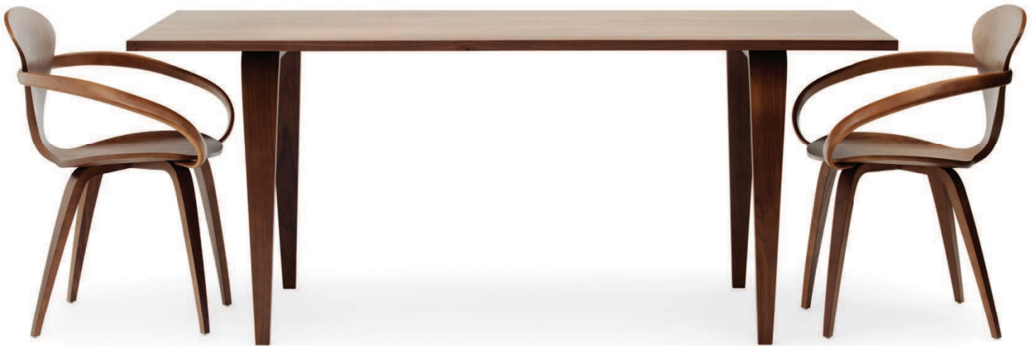
72" x 34" Classic Walnut