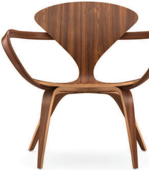
left to right: Natural Walnut w/ upholstered pads Natural Walnut