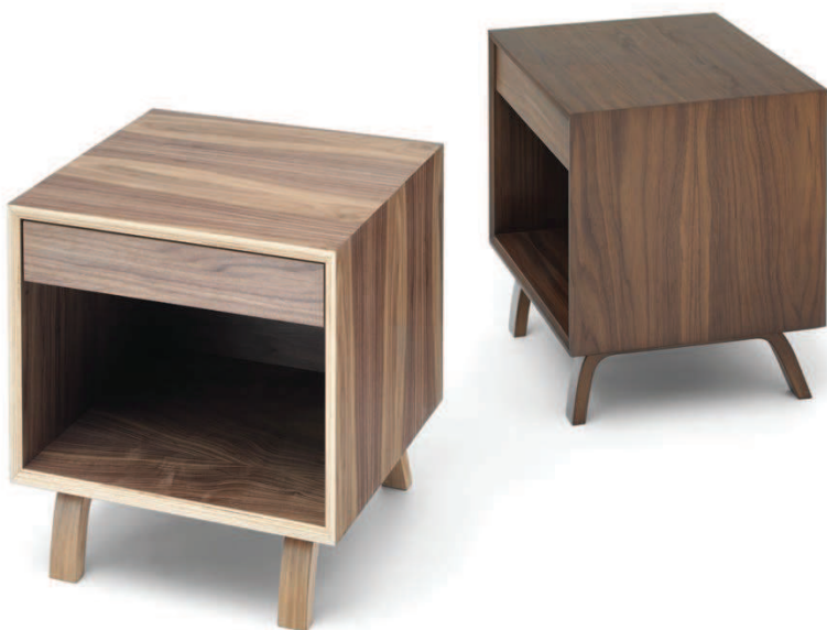
from left to right: Natural Walnut, Classic Walnut

Perfectly scaled beside storage with a single drawer. The new Bedside Tables are built entirely from laminated, molded and cross-ply plywood. American Walnut veneers and contrasting edge laminations create a strong geometry and highlight the handcrafted mitered joinery. Cherner Bedside tables are sustainably made in the U.S.A.