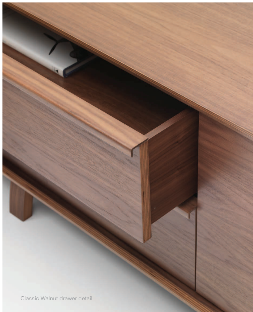
Classic Walnut drawer detail