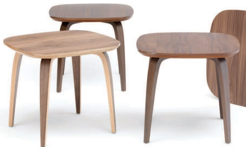
from left to right: Natural Walnut, Classic Walnut

The new Side Table is a versatile small scale table for living, bedroom or lounge areas. The veneered top is made of 1-1/8" thick cross-ply plywood with an exposed profiled edge. The legs are laminated wood with an exposed edge. Cherner Side tables are sustainably made in the U.S.A.