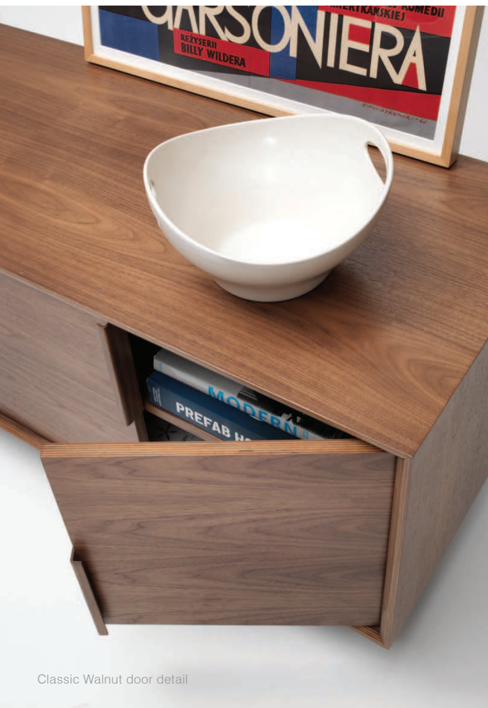
Classic Walnut door detail