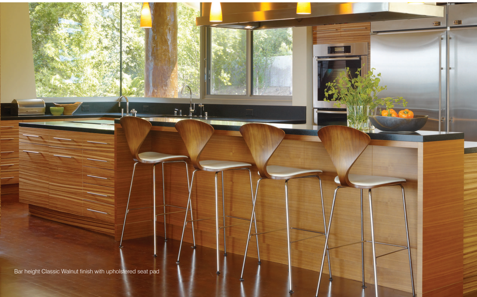
Bar height Classic Walnut finish with upholstered seat pad